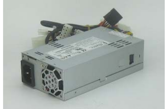
Dimension ( L x W x H ) : 150 x 82 x 43 mm